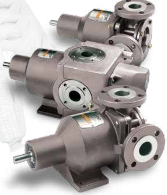
E1-Series Seal-Less Internal Gear Pump